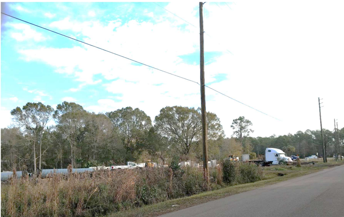
Adjoining property to the north (across New Brandy Branch Road)