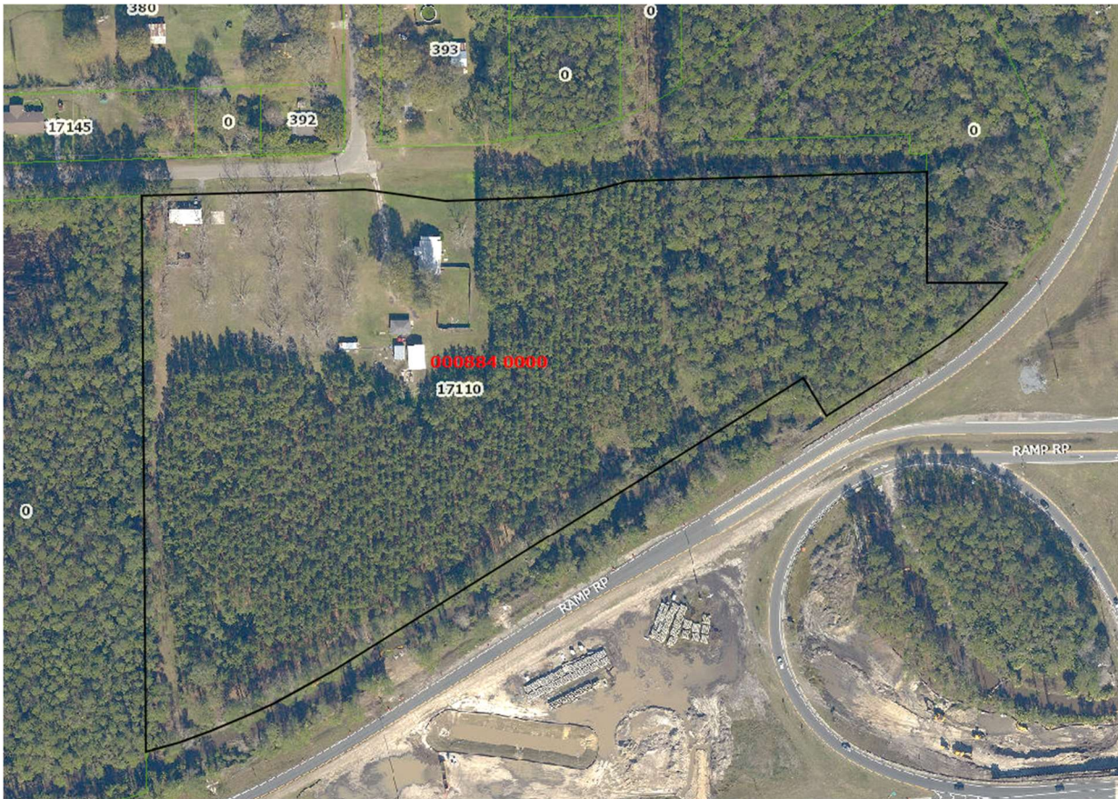
Aerial of subject property