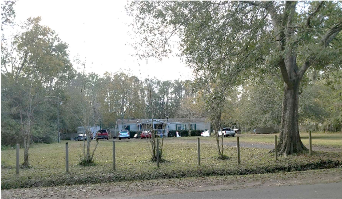
Adjoining property to the west